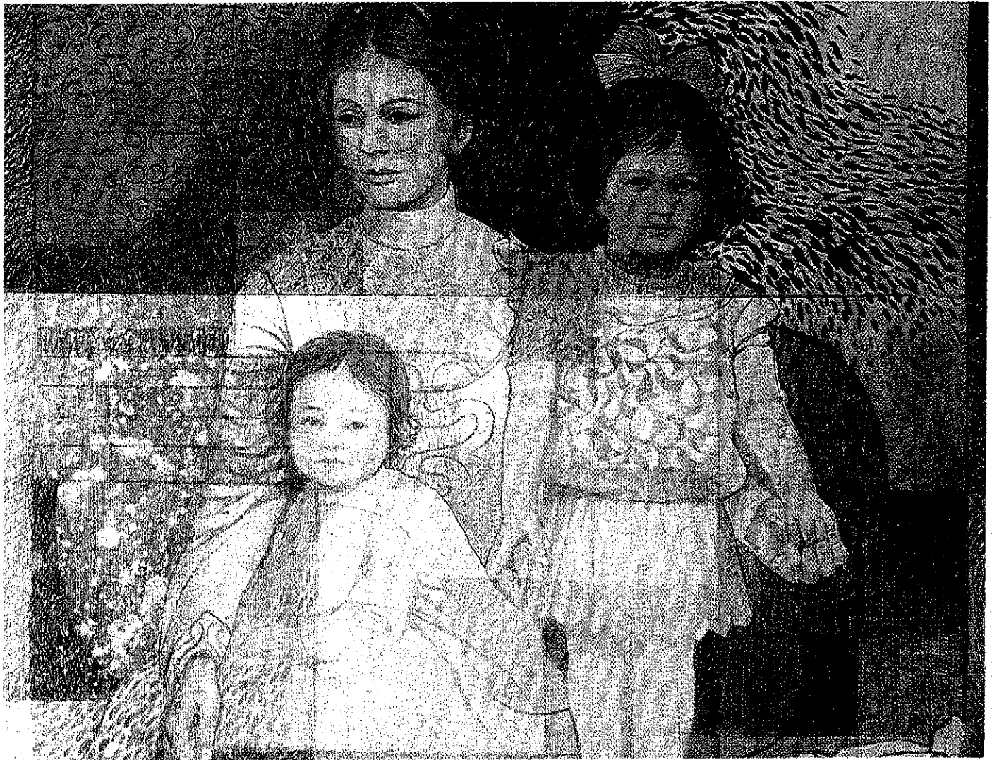
Tom Heflin, detail of Try to Remember . Private collection

a part of the frankly villainous dictum that all is fair in love and war.